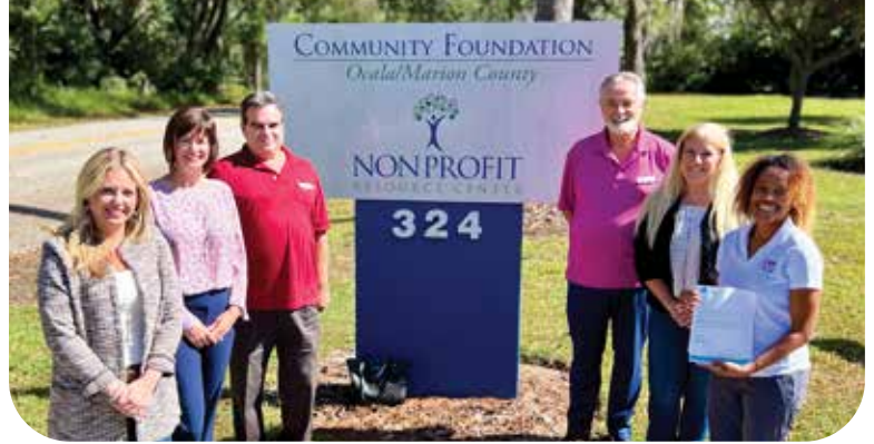
Patterson Foundation Grant Presentation